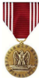
Good Conduct Medal