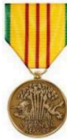
Vietnam Service Medal