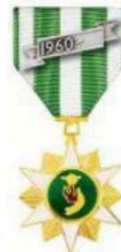
Vietnam Campaign Medal