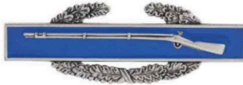
Combat Infantryman Badge