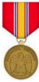
National Defense Service Medal