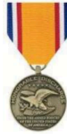
Honorable Discharge Medal