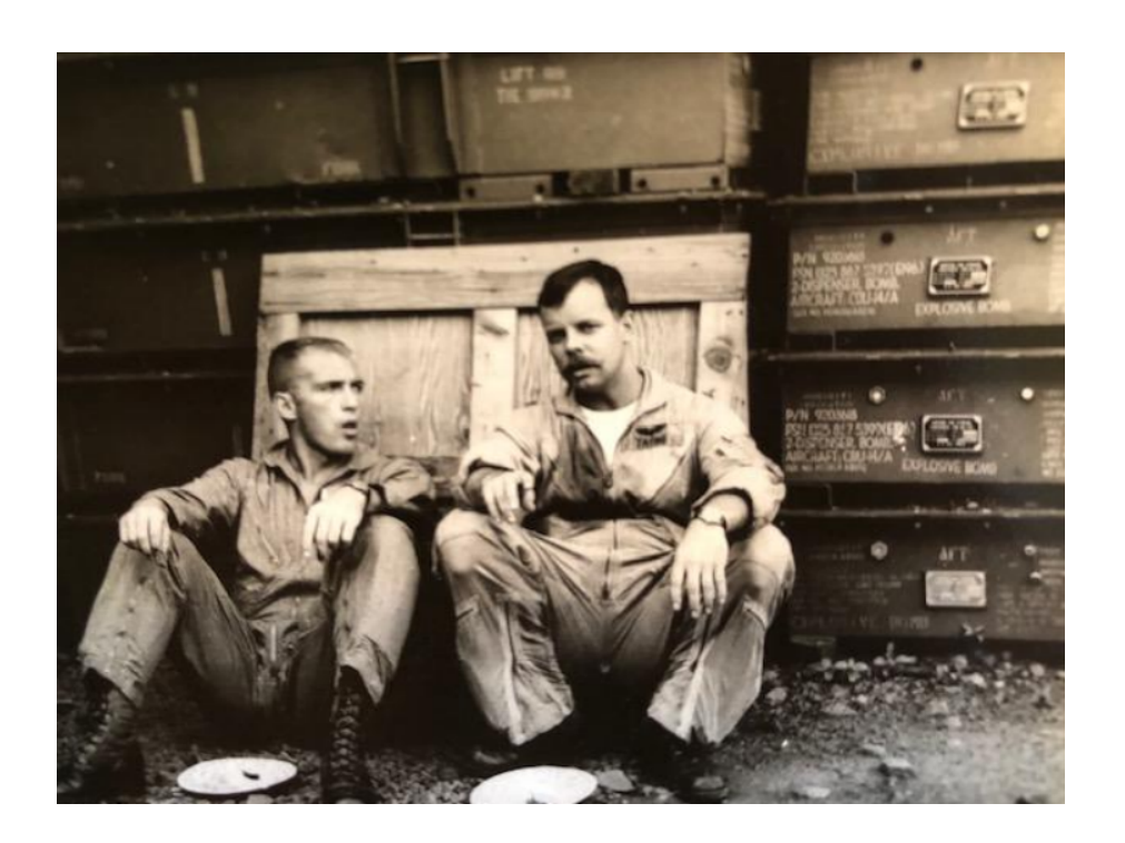
This is me and USAFA classmate, an A1-E pilot, sitting among stacks of Cluster Bomb canisters.

In what was to be the last TRIAD Exercise with United States, Australian, and New Zealand Air Forces during October 1984, I led the 12th Tactical Fighter Squadron, 18th Tactical Fighter Wing, Kadena Air Base, Okinawa, with eight F-15C aircraft to the Royal New Zealand Whenuapai Air Force Station, a short distance from Auckland on the north Island. I was the 18th Wing Deputy Commander for Operations, a Colonel.